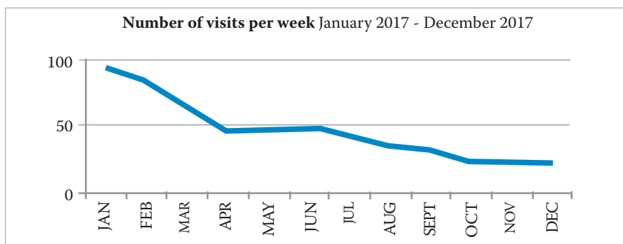
Figure 3. Frequency of nurse visits

caseload reviews with the community nurses to identify the number of patients on their caseload who were being treated for leg ulceration and specifically those who had venous leg ulceration. The patient's records were audited to determine if the patient had: